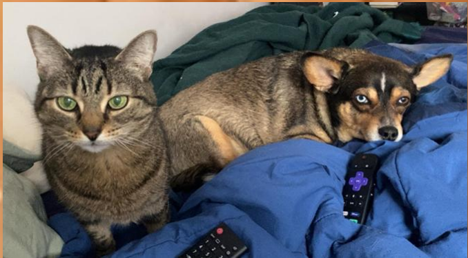
(Top photo: Geo and Benny(in TX); Bottom photo: Zorrah & Lulu (in IL)